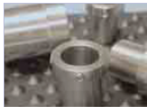
Protect small parts that may fall to the floor from chipping or marring.

Important: Most plastics will ignite and sustain flame under certain conditions. Caution is urged where any material may be exposed to open flame or heat generating equipment. Use Material Safety Data Sheets to determine auto-ignition and flashpoint temperatures of material or consult Quadrant Engineering Plastic Products. WARRANTY: Characteristics and applications for products are shown for information only and should not be viewed as recommendations for use or fitness for any particular purpose. TIVAR® and ProKnob™ are registered trademarks of the Quadrant group of companies.