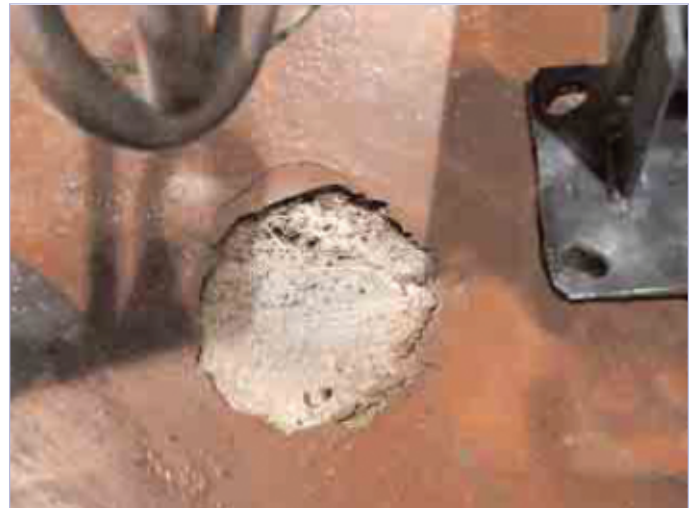
Prevent equipment and floor damage. Choose Armor-X

For protection you can count on, choose Armor-X, the new polymeric solution.